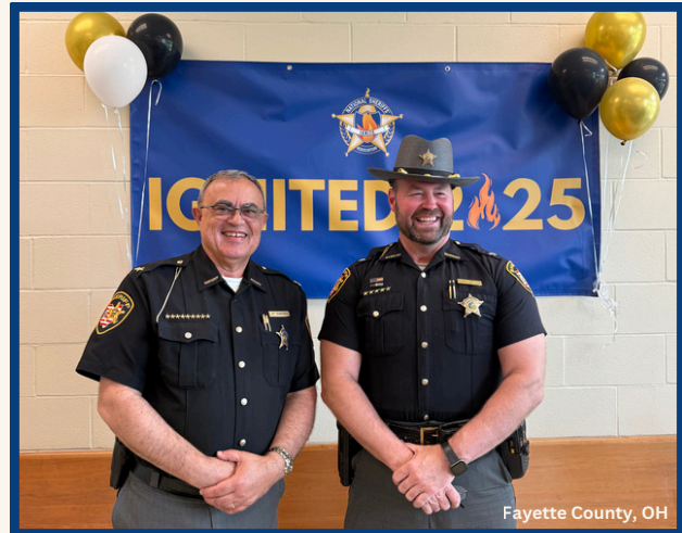
Fayette County, OH

Fayette County is making steady progress toward expanding and enhancing IGNITE programming. Pathways is set to launch parenting classes by mid-August, and coordination with Southern State Community College is underway to begin GED classes in early September. The team is also preparing to kick off the career development re-entry class, with the curriculum currently in progress. Momentum is building for a robust fall of IGNITE programming!