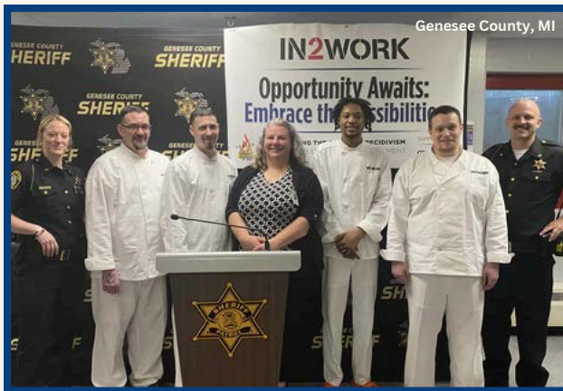
Genesee County, MI