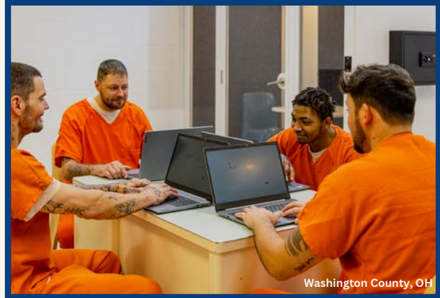
Washington County, OH

The Washington County Sheriff's Office has officially launched its first IGNITE class at the Washington County Jail, beginning with foundational courses in Literacy and GED preparation. These initial offerings mark the start of a broader educational program that will soon expand to include life skills, ServeSafe certification, financial literacy, and additional subjects aimed at supporting personal growth and reentry preparation.