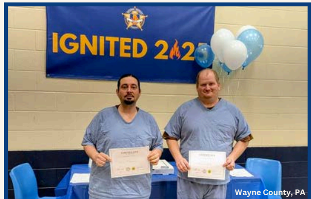
Wayne County, PA