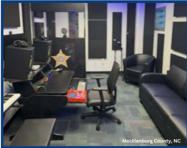
Mecklenburg County, NC

The Mecklenburg County Detention Center proudly announced the grand opening of Studio W5HY?, a state-of-the-art soundproof music studio, as part of its groundbreaking new program, “Rhythm & Reflection: A Journey to Reformation”. The studio was created in partnership with the Tim Bergling Foundation in honor of the late Swedish artist Avicii (Tim Bergling). This innovative studio space aims to provide incarcerated individuals with tools for healing, self-expression, and lasting change. “Rhythm & Reflection” is a program that merges rhythm - through music, movement, and routine - with reflection, using journaling, meditative practices, and group discussion. Its mission: “A place where rhythm and reflection meet reformation, to explain the WHO, WHAT, WHEN, WHERE, WHY, and HOW of YOU! A journey inside of self to methodically release guilt and shame, for restoration and reformation of self”. The program encourages residents to explore their past, confront guilt and trauma, and develop the self-awareness and emotional tools necessary for reintegration and renewal. Through this methodical approach, individuals examine their identities, motivations, and choices, with a focus on rebuilding self-worth and developing responsible decision-making strategies.