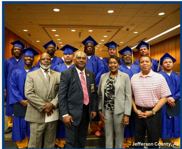
Jefferson County, AL