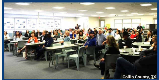
Collin County, TX

On June 13th, the Collin County Sheriff's Office held its first Programs Open House at the Collin County Detention Facility. The event welcomed state and local representatives, local colleges, volunteers, religious organizations, and other community partners. Through IGNITE, the Sheriff's Office is determined to support inmate rehabilitation through structured programming. These efforts are helping individuals rebuild their lives and reinforcing the value of strong community collaboration within the facility.